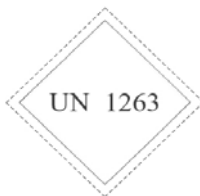
Limited Quantity/Consumer Commodity: Example

LIMITED QUANTITY EXEMPTION – You now have a choice! A couple of years ago the UN adopted a standardized safety mark for Limited Quantity shipments. If you had a Limited Quantity shipment of paint the package could be marked with either of the following safety marks.